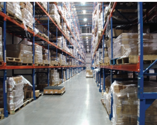
Pallet storage in the facility.

Dietz & Watson associates quickly went from strict picking to batch picking and wave planning while maintaining full work audit trail. Their DSD (Direct to Store Distribution) shipments, which were very time consuming and labor intensive, are now shipped seamlessly and on time.