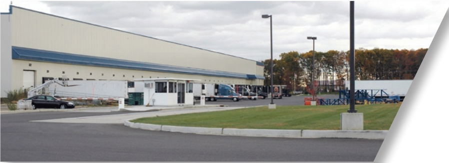
Guard check in for trucks before entering the yard.