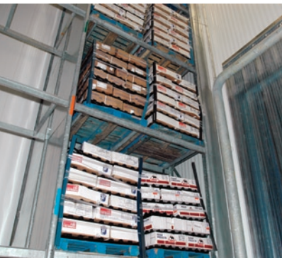
Storage in minus 10 freezer area.

Customer service has also been enhanced greatly with Softeon's supply chain execution solution. Previously, when a customer called with a question, an answer could not be provided immediately. It had to be researched and then the customer was called back. Now, the answer is at the finger tips of any associate. The second phase of the system will include a visibility portal for the customer. Manufacturing also has complete visibility which allows production to coordinate closely with distributors who sell and take orders for Dietz & Watson products. The system has impacted and improved their complete supply chain. Not only was the highly complicated solution installed on time, but it was a less than six month install from selection in September 2006 to being live in January 2007.