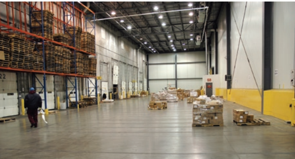
Incoming freight received and staged for putaway.

The RFP was initially sent to 14 vendors. Transtech evaluated the total solution offering – functionality, technology and customer support – from each vendor. The key decision drivers were cost of ownership, strength of the vendor, ability to compliment future growth with operational efficiencies and robust ancillary functionality. While Dietz & Watson was initially only interested in the WMS, they wanted a solution that positions them to easily integrate complementing functions in the future. The selection was narrowed down to two companies and finally Softeon was selected for their state of the art architecture, robust functionality, and customer service/support reputation. As significant was Softeon’s suite of robust solutions that included Order Management, Labor Management, Transportation, and Slotting, which could be easily integrated at a later time.