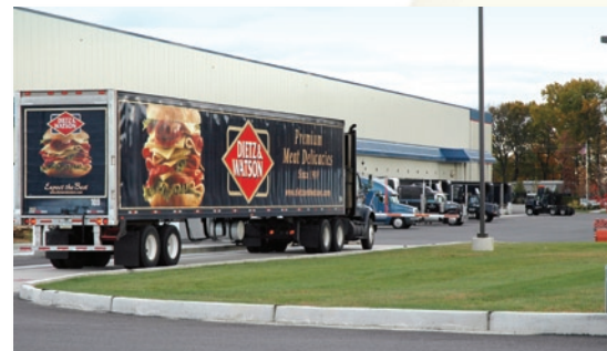
Dietz & Watson truck entering yard at the New Jersey Distribution Center.

The distribution center is approximately 300,000 square feet with several different temperature controlled areas ranging from 28 to 34 degrees all the way down to freezers kept at minus 10. Having many product lines and variables to manage, Dietz & Watson wanted a strategic implementation plan that had the lowest impact on their daily operations while continuing to provide a high level of service to their customers. They decided on a phased approach of implementing one product line at a time over a period of 4 months , minimizing operational impact and reducing overall risk. This implementation strategy combined with Softeon’s experienced team ensured zero downtime during the implementation.