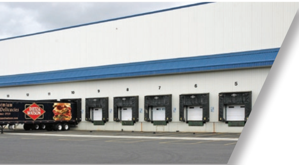
Shipping doors ready and available for the morning loading process.